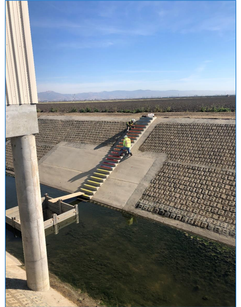
PUMP STATION WATER INTAKE BOX