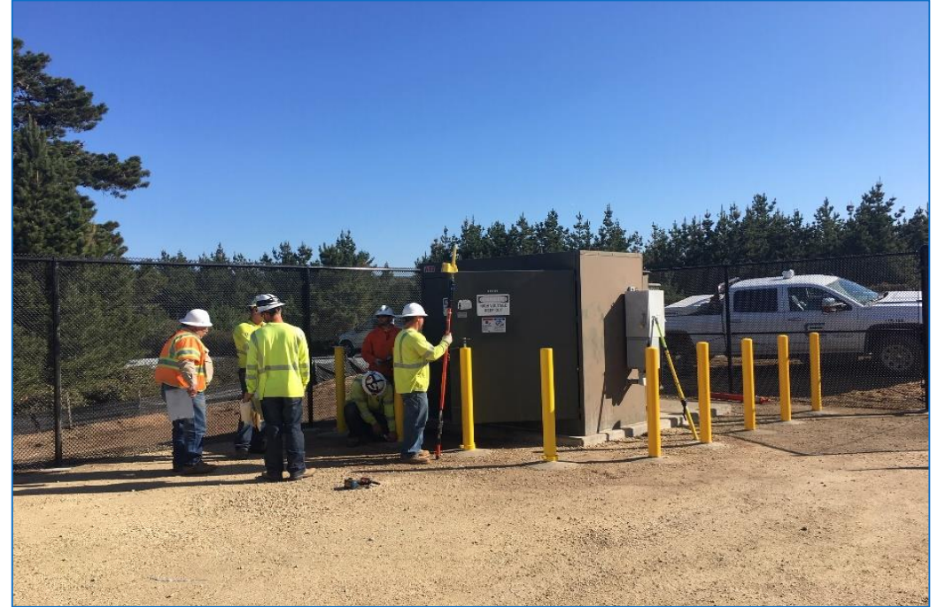
ENERGIZING THE 21 KV TO 4 KV STEPDOWN TRANSFORMER