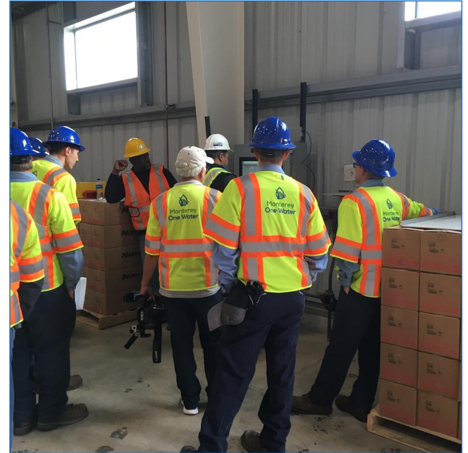
OZONE SYSTEM TRAINING M1W OPERATIONS, UTILITIES, & MAINTENANCE STAFF