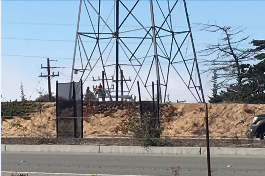
SETTING THE FUSES ON THE 21 KV LINE