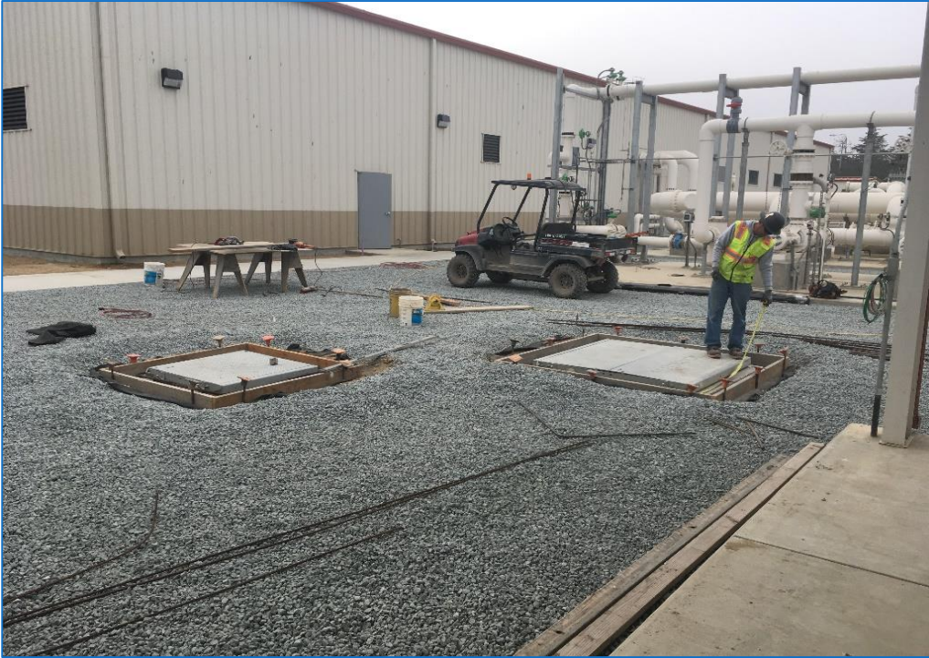
PLACING CONCRETE COLLARS AROUND ELECTRICAL PULL BOXES