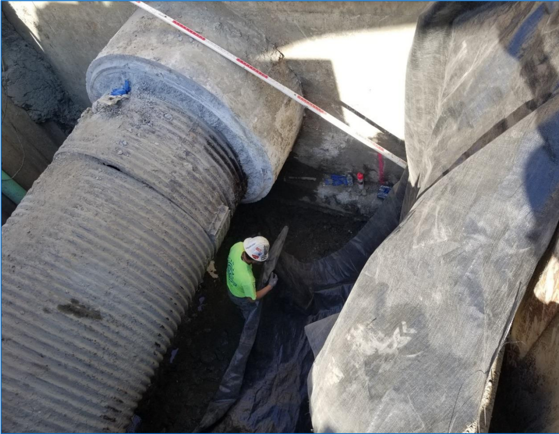
CONSTRUCTION OF STORMWATER (SW) DIVERSION VAULT AROUND EXISTING 66" SW PIPE