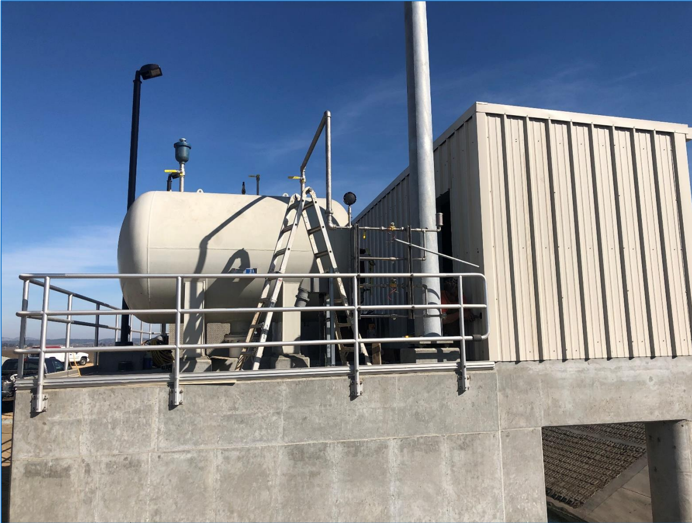
PUMP STATION W/ ELECTRICAL BLDG. & SURGE TANK