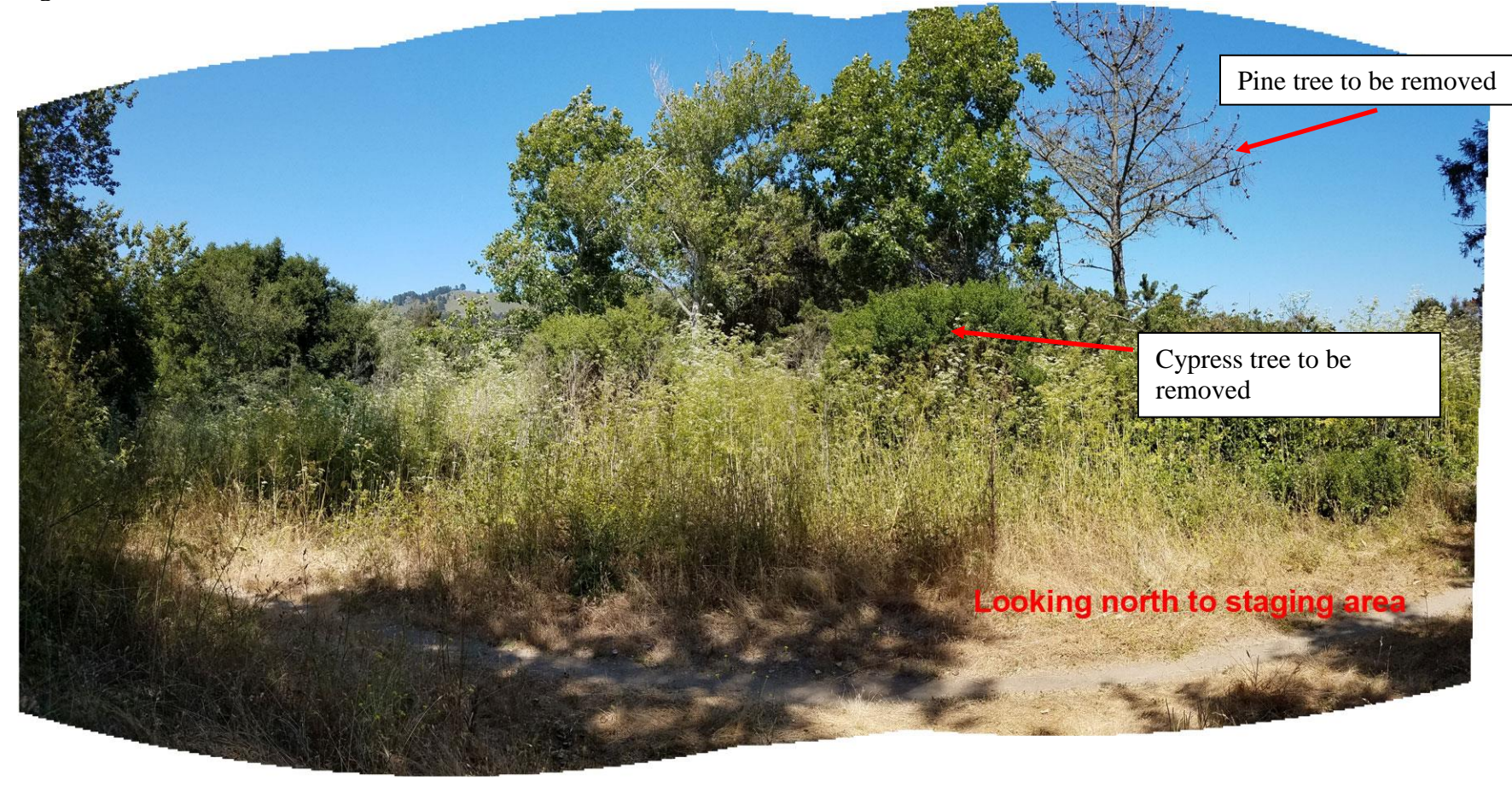
Figure C – view to staging area to be cleared