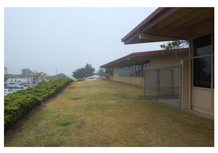
Page 5 of 11