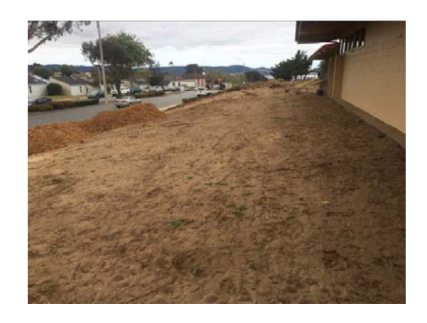
Monterey Peninsula Unified School District Monterey Peninsula Water Management District Water Conservation Grant Proposal