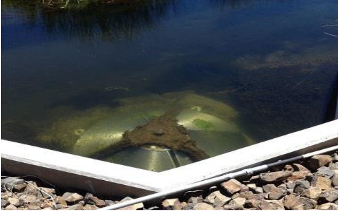
Image 2- Example of cone screen underwater in an alcove with external cleaning brushes in operation.