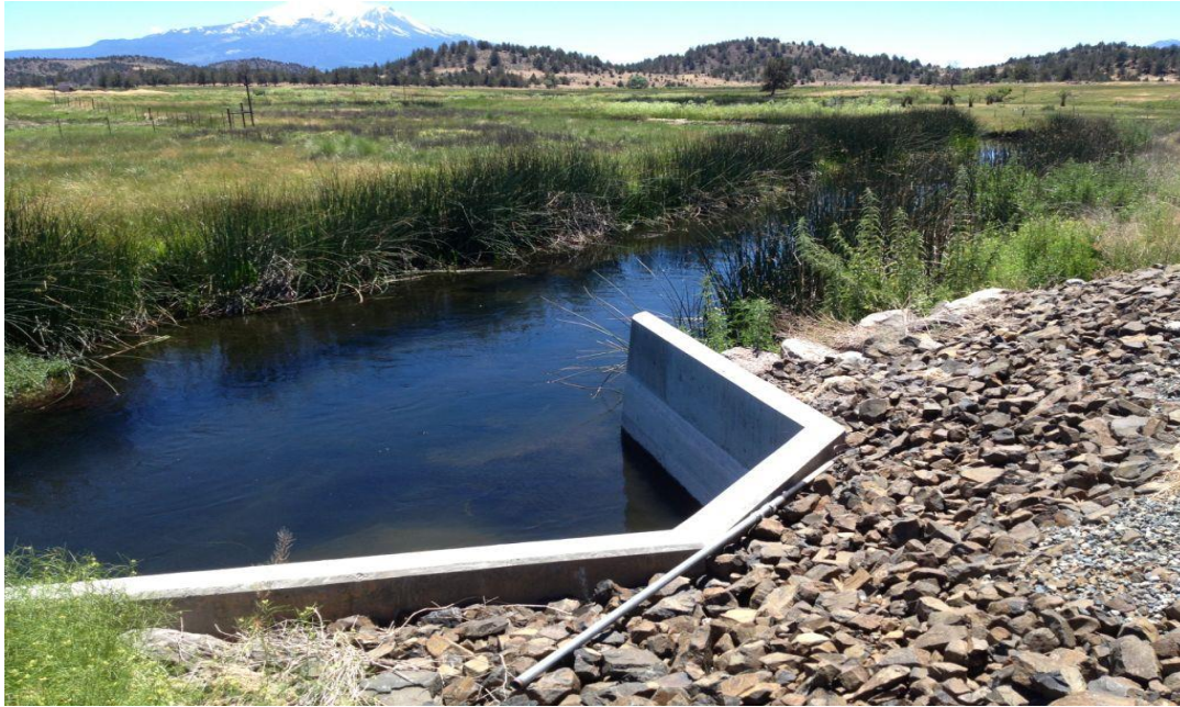
Image 1- Example of alcove built into stream bank to house a cone-shaped fish screen.

Another possibility is relocating the intake from the current location to the 12 foot deep pool at the facility outfall. Water supply may be somewhat colder at this location, and water level would be more secure during drought periods. An intake at this location would also be more protected from leaves and other debris, reducing maintenance. However, pumping costs at this location would be significantly higher.