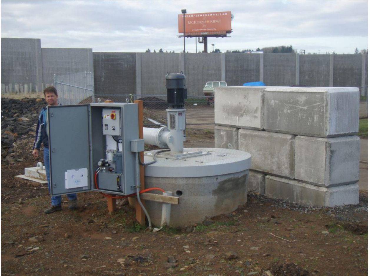
Image 3- Example of pump motor and electrical supply raised out of wet well to improve access.