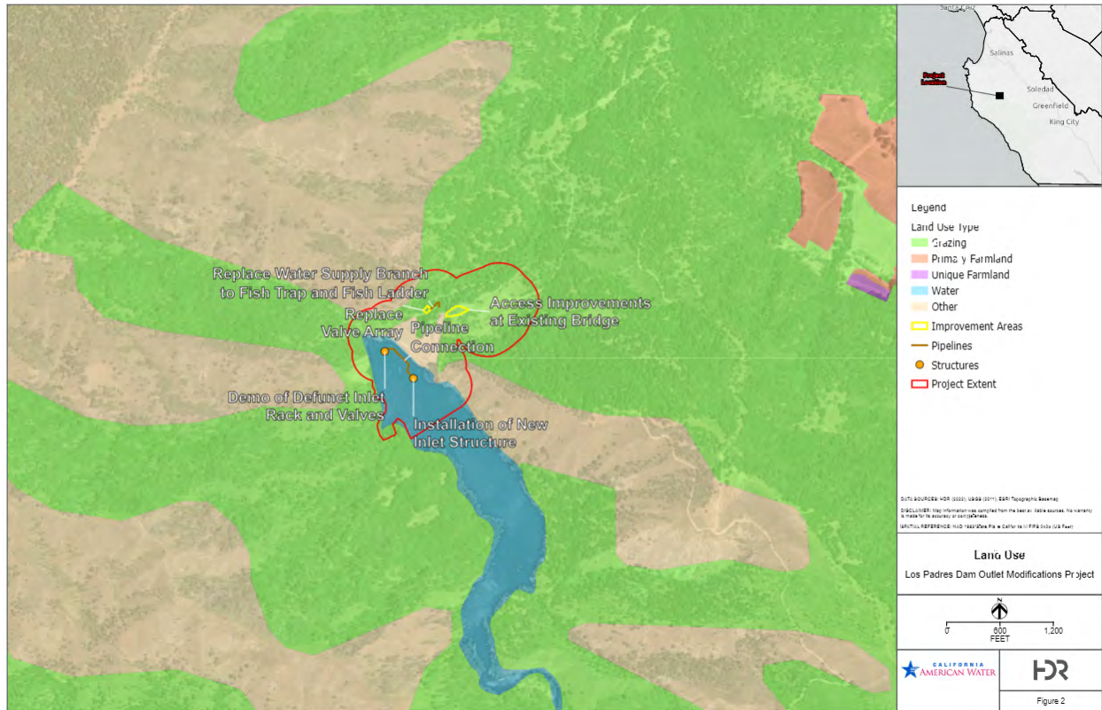
Figure 2. Local Land Uses