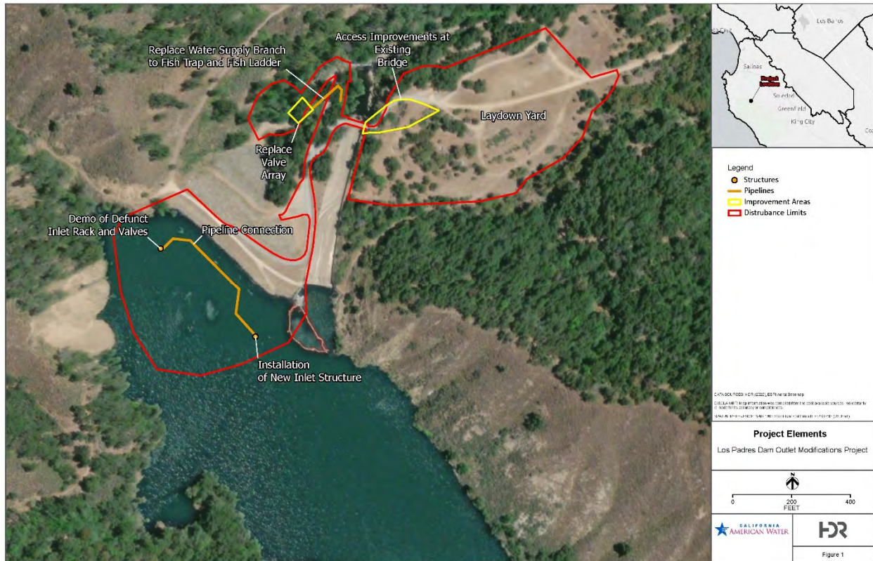
Figure 1. Project Elements