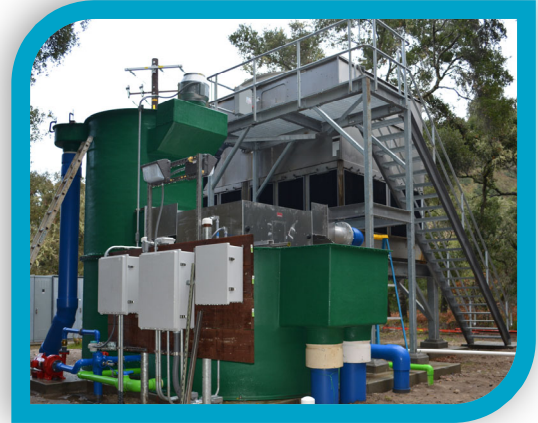
New construction at Sleepy Hollow Steelhead Rearing Facility. When the upgrade is completed the facility will operate during periods of extreme drought or high flows and should be operational for the 2020 fish rescue and rearing season.

Staff also conducted late season redd (steelhead nests) surveys, counting 121 redds in 23 miles of river. And for the fourth year, Staff continued to work with NMFS on field studies to develop a steelhead population life history model for the watershed, based on tagged fish from NMFS' studies and MPWMD fall population surveys. This effort included assisting NMFS with basin-wide population surveys and installing tag detection arrays from the lower Carmel valley to above Los Padres Reservoir.