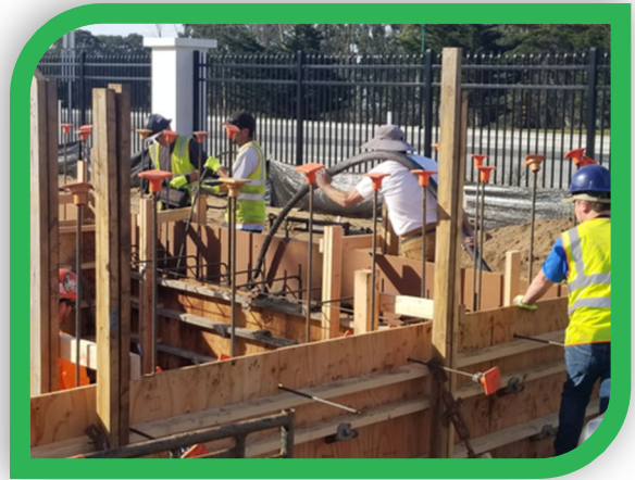
Construction of Santa Margarita Water Treatment Facility underway in 2019. Planned for treatment of stored water from the Pure Water Monterey Project, and other ASR sources.

In 2019 the District took the lead role to coordinate the IRWM plan update, expected to be approved by the State in early 2020. The IRWM Group also expanded by 9 members bringing the total number of partners to 16.