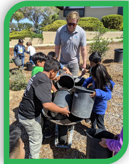
Water-wise landscaping and demonstration garden at Martin Luther King Jr. Middle School. The District's $60,000 grant facilitated removal of 13,424 sq. feet of turf and 8,256 sq. feet of juniper to achieve an 84% reduction in water use on the site.