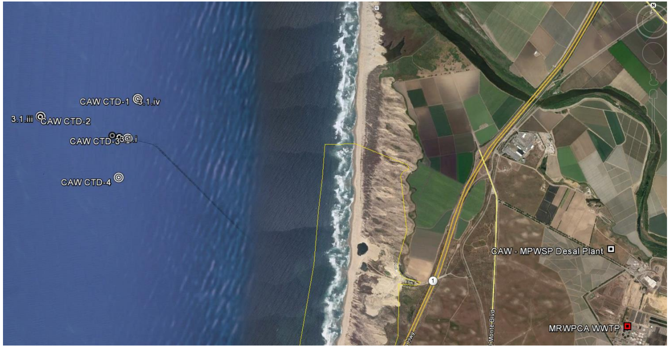
Figure 1 – Overall View