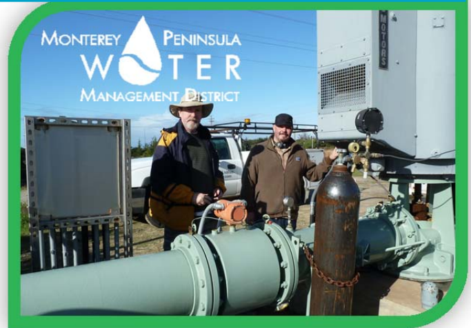
The Water Management District's Aquifer Storage and Recovery project site.