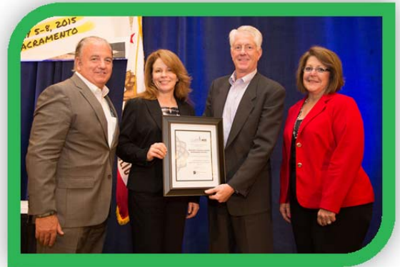
The Association of California Water Agencies presented the Clair Hill Award to the Water Management District for completion of the Pure Water Monterey Demonstration Facility – a joint project with the Monterey Regional

Requirements for Future Capital Improvements: Based on the stated future demands discussed above, the resulting desalination facility size is 6,252 AF with Pure Water Monterey Groundwater Replenishment (GWR), or 9,752 AF without GWR. The Pure Water Monterey project expected to create 3,500 AFY of new supply is being cosponsored by the Monterey Regional Water Pollution Control Agency and the District, which funds 75% of that project from its Water Supply Charge. Product water will be stored in the ground for 6 months and recovered for sale to Cal-Am. Aquifer Storage and Recovery is expected to be doubled in capacity by 2019, to almost 3,000 AFY and is being developed jointly by the District and Cal-Am. However, until permit conditions are modified subsequent to the future lifting of the Cease and Desist Order, not all ASR capacity is reliably available in dry years, hence cannot all be counted upon to offset unlawful diversions. The District continues to develop plans for additional ASR opportunities for future water supply.