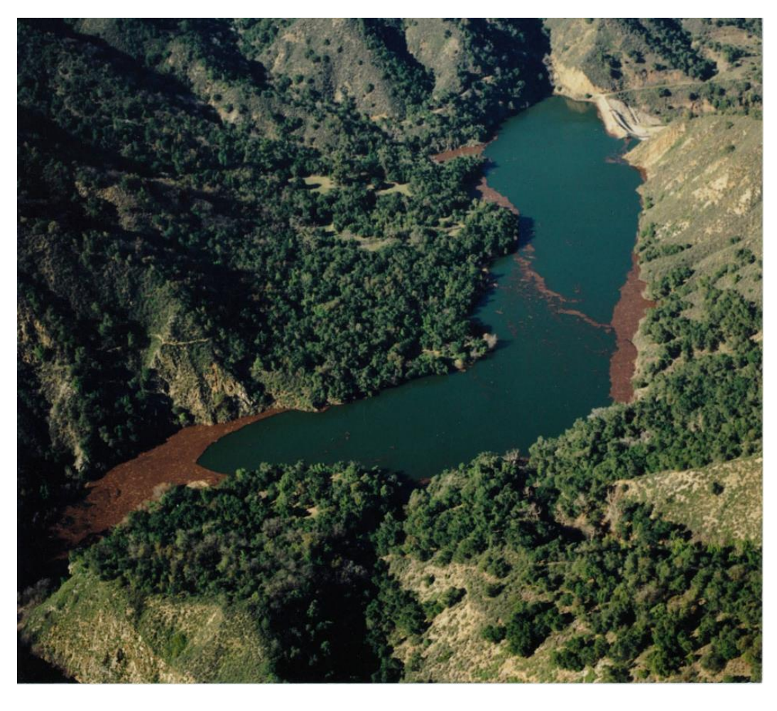
Figure 20 – debris in reservoir, January 1995