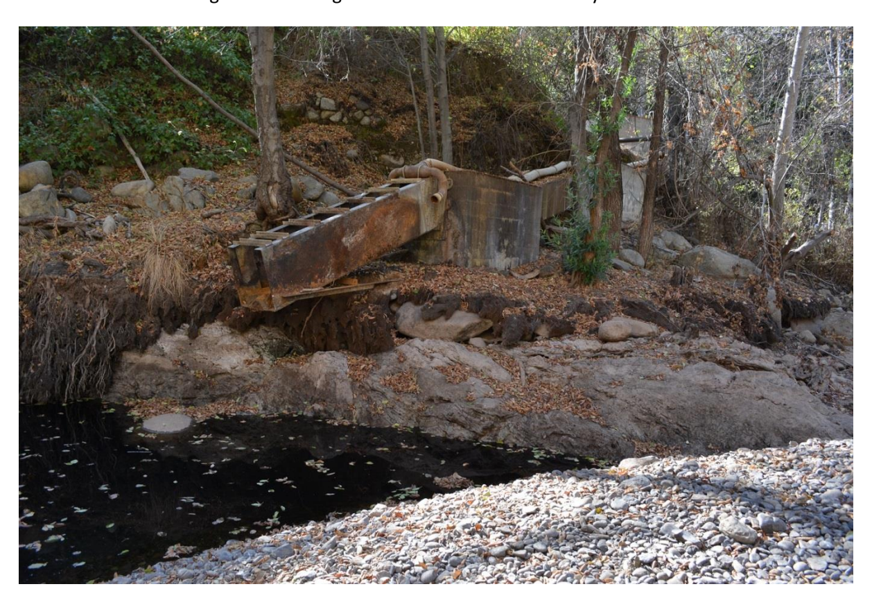
Figure 7 – Existing weir fishway (Denil ladder) entrance in plunge pool