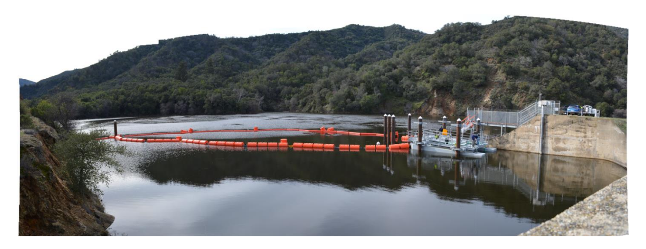
Figure 14 – Behavior Guidance System at dam spillway