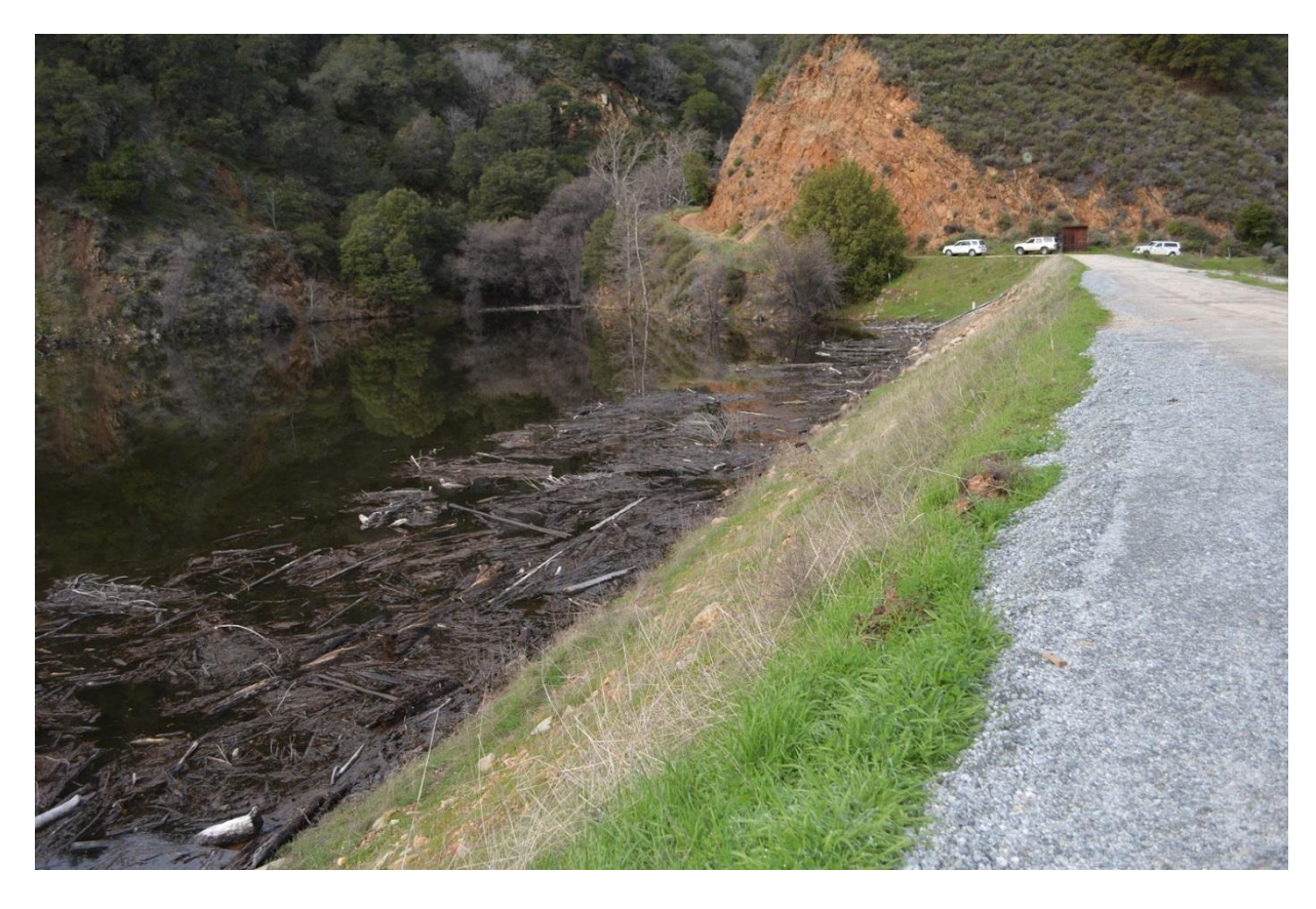
Figure 11 – looking west along top of dam from mid-point of dam to west abutment