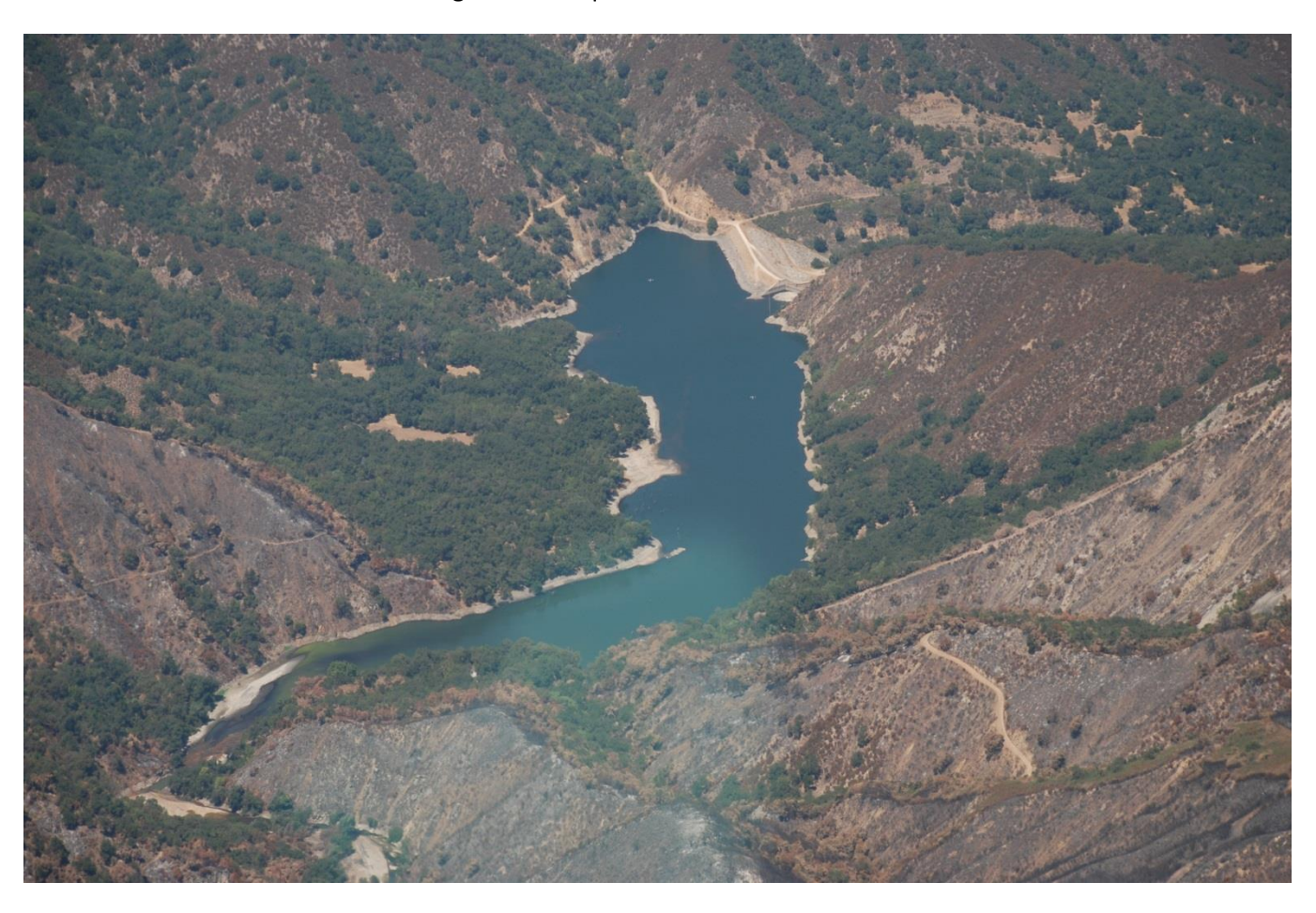
Figure 2 – Los Padres Dam and Reservoir