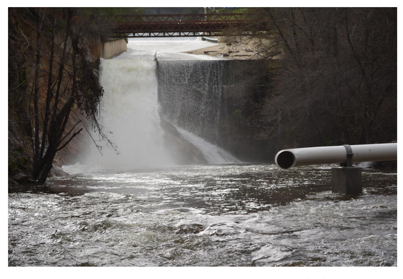
Figure 4 - Looking south to plunge pool and Behavioral Guidance System (BGS) pipe outlet