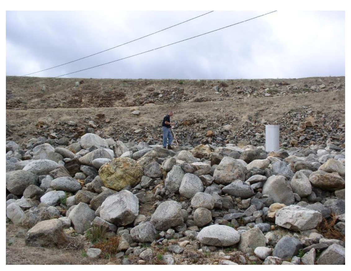
Figure 13 – boulders placed to stabilize downstream face