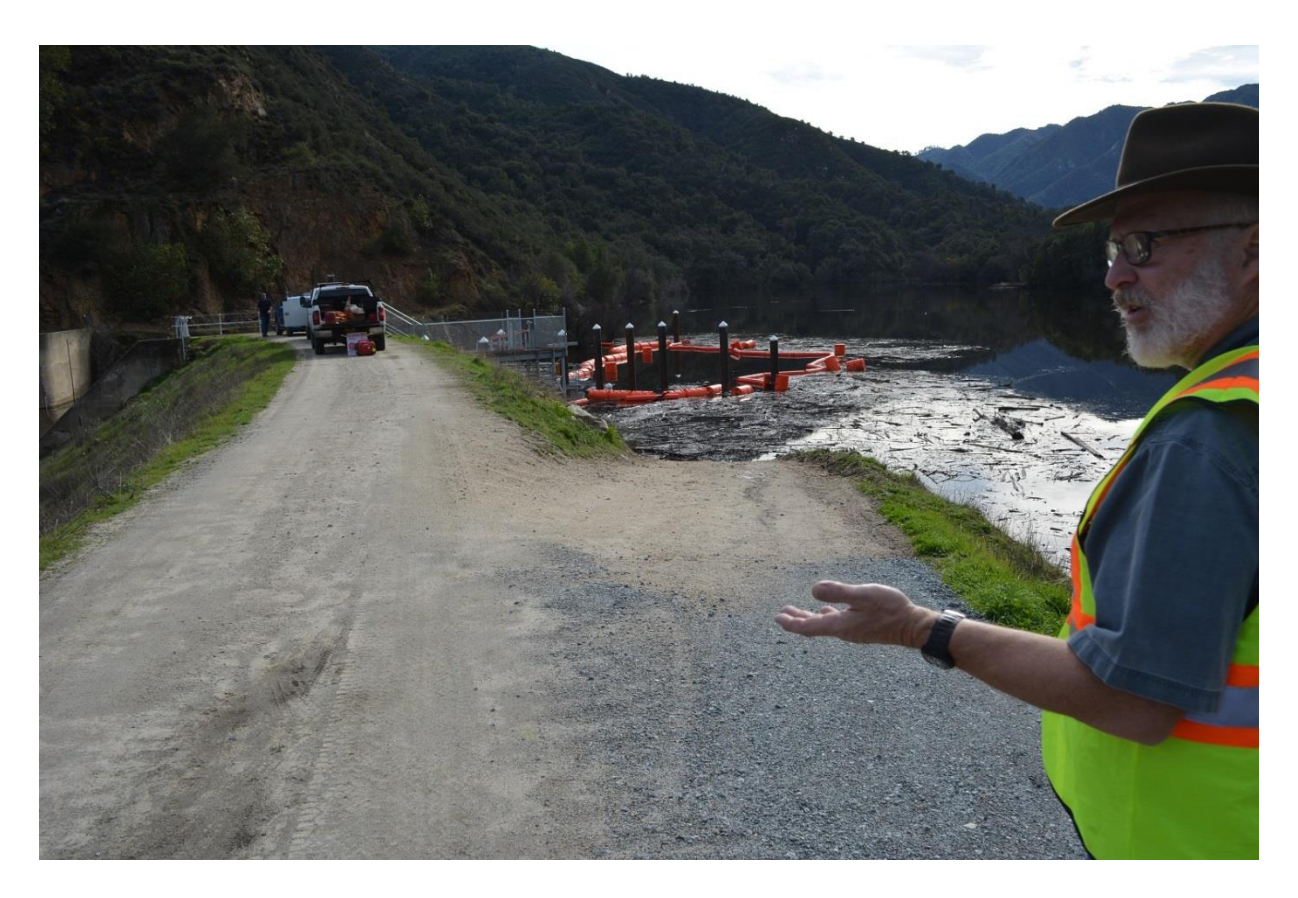
Figure 10 – looking east along top of dam toward spillway