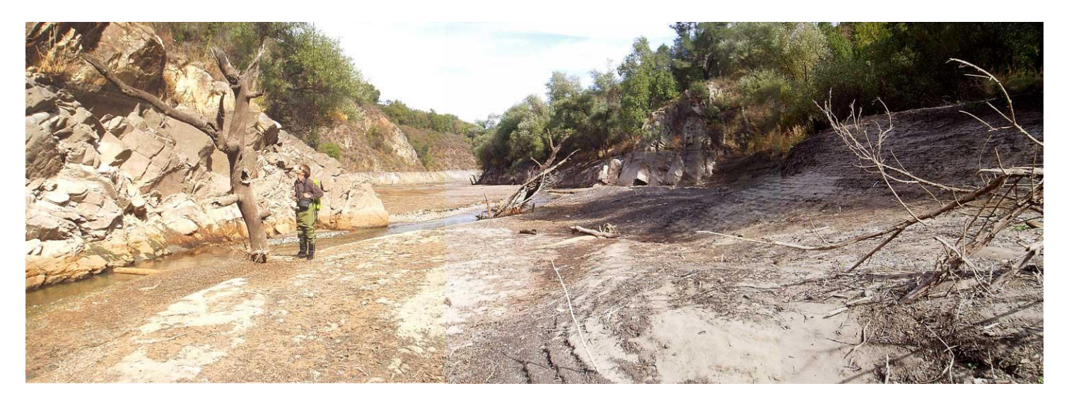
Figure 18 – siltation at upper end of reservoir