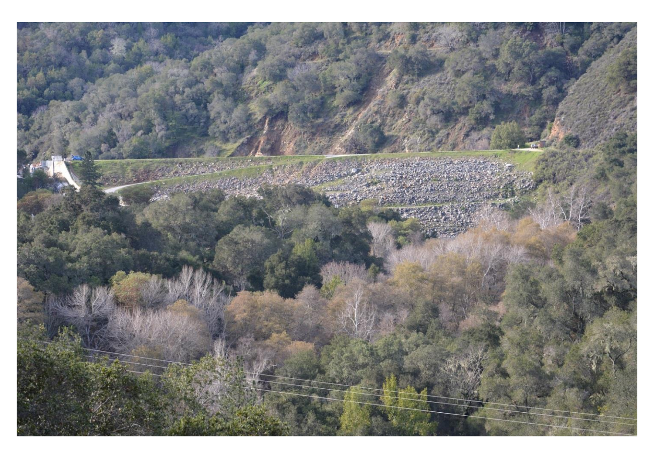
Figure 3 – Looking south to dam face