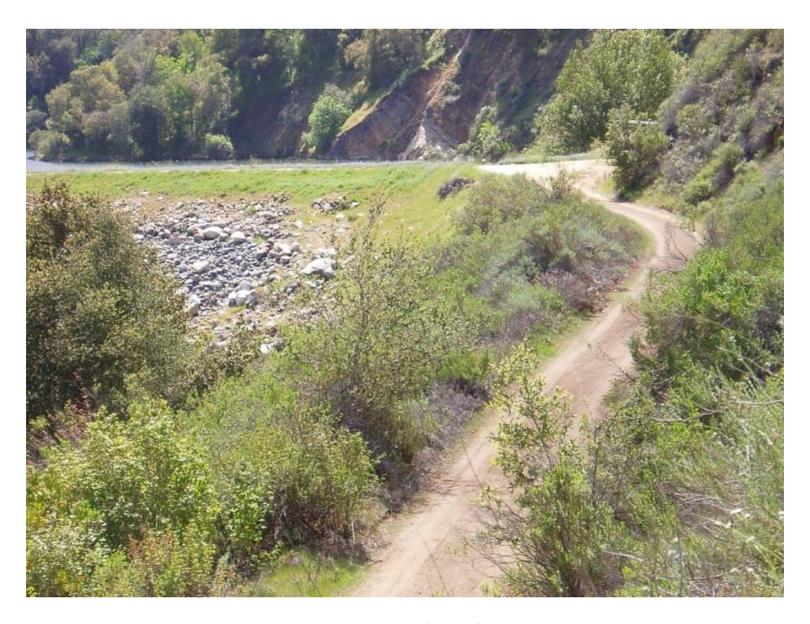
Figure 12 – Looking upstream (south) to west abutment