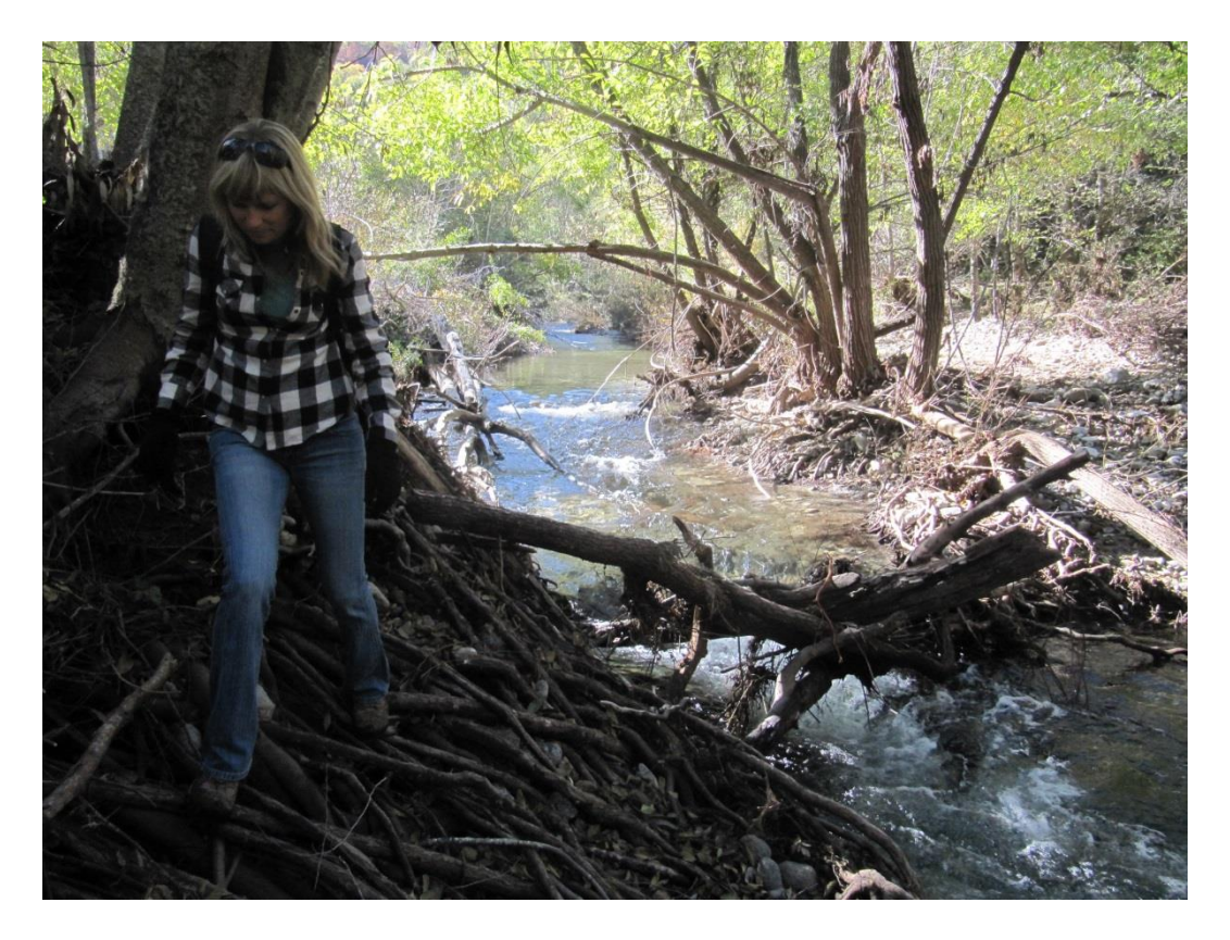
Figure 19 – upstream end of inundation zone