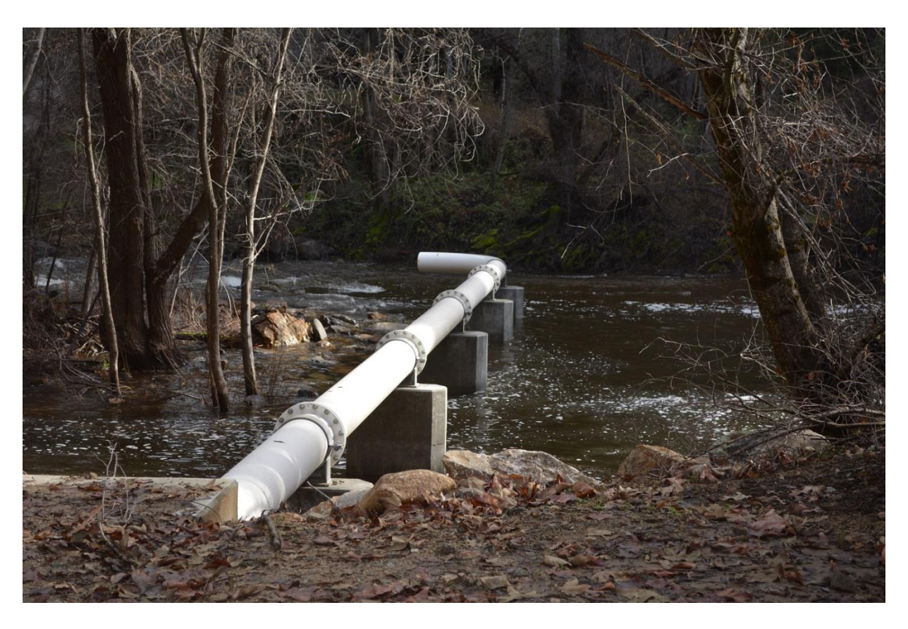
Figure 6 – looking east at Behavioral Guidance System exit