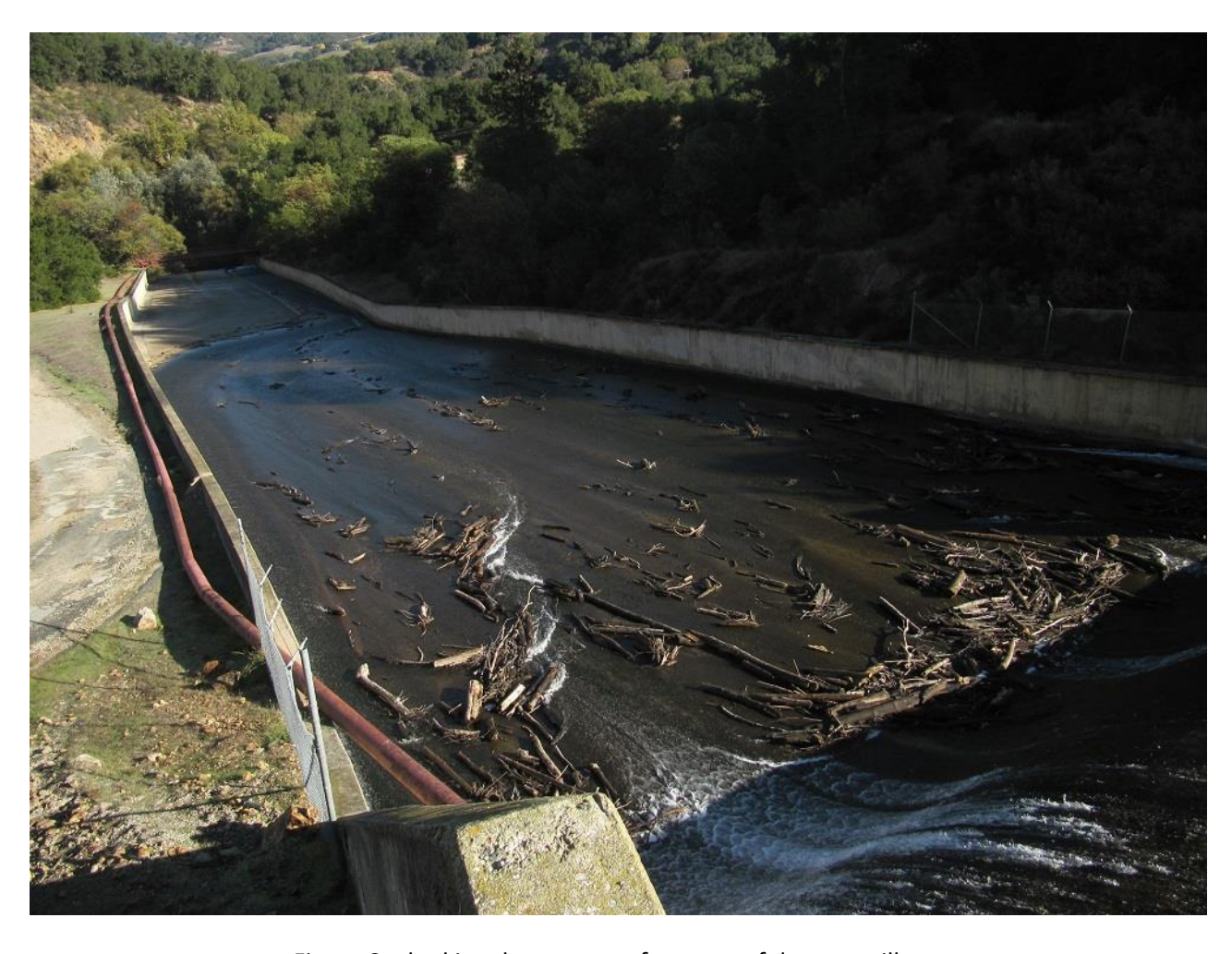
Figure 8 – looking downstream from top of dam to spillway