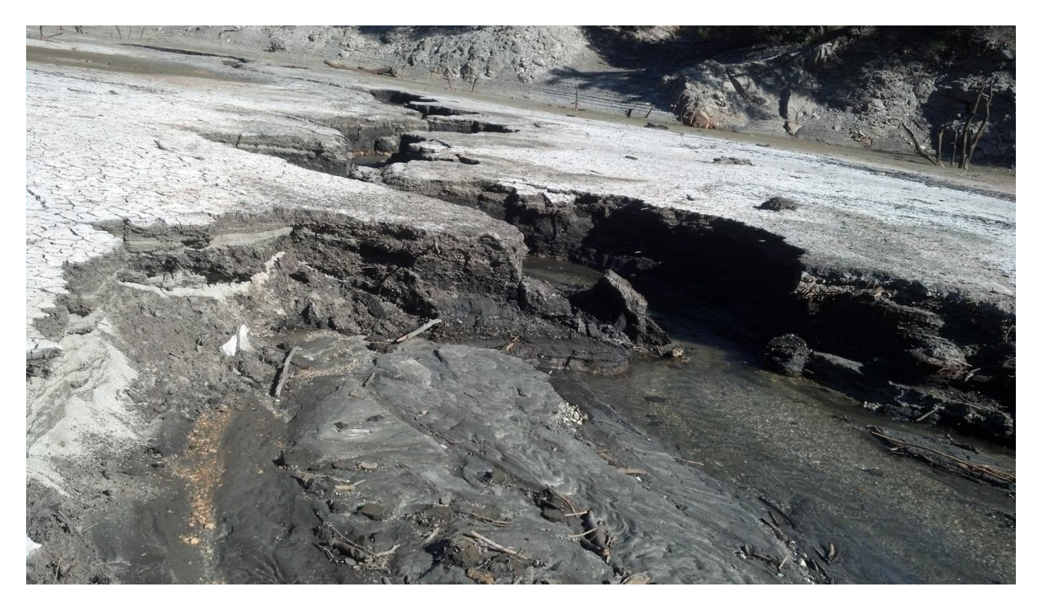
Figure 17 – upper reservoir silt and organic deposits