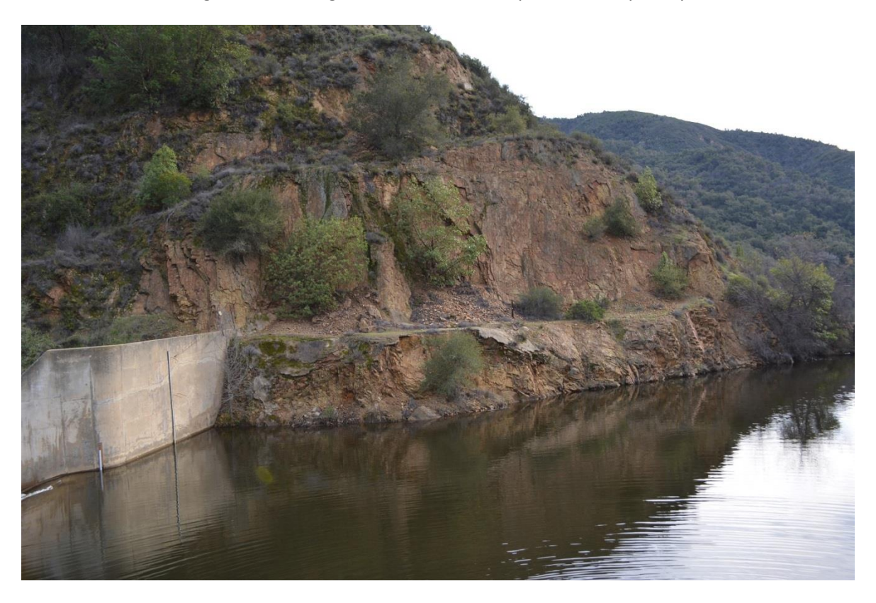
Figure 9 – east abutment