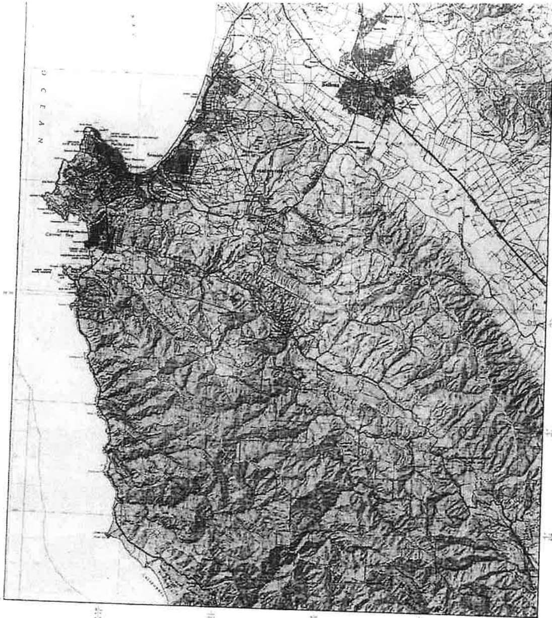
MAP SHOWING MPWMD BOUNDARY AND CARMEL RIVER WATERSHED BOUNDARY 2002