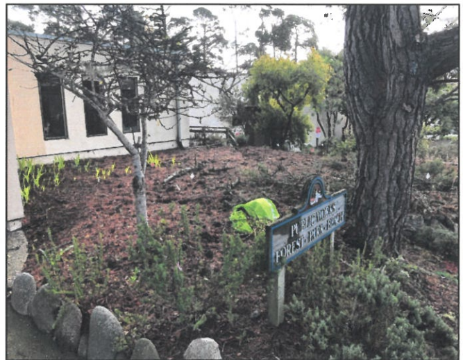
Project location viewed from sidewalk and Public Works Department walkway