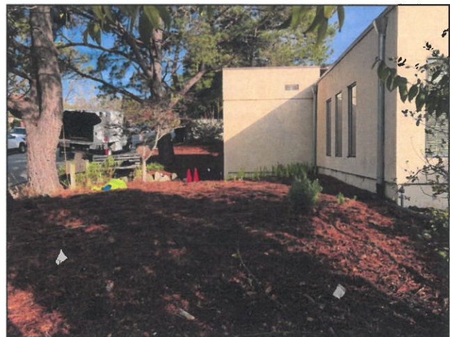
Project location viewed from the roof of the Public Works Department and from the south side of the proposed rain garden location, looking north.