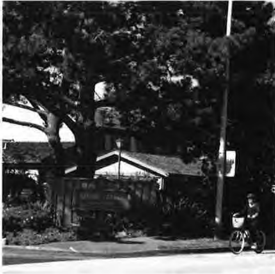
Arroyo Carmel 3850 Rio Road, Carmel