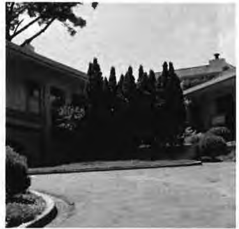
Town House Condos