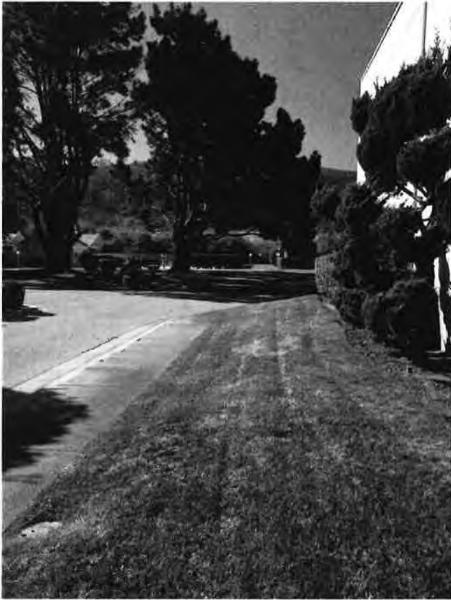
Riverwood 4000 Rio Road, Carmel