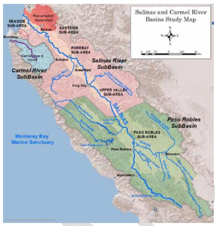
Figure 2 Basin Study Plan Area