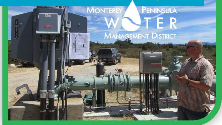
Water District's Aquifer Storage and Recovery project site.

Successfully rescued 5,115 wild steelhead (including 1,295 collected during trapping operations) from over 10 miles of the Carmel River, and released them to upstream permanent habitats above Esquiline Road. The Sleepy Hollow Steelhead Rearing Facility could not be operated due to critically dry low flow conditions during this third drought year.