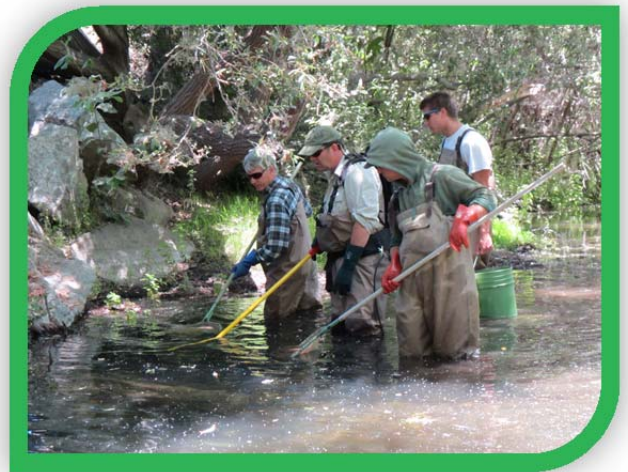
MPWMD staff rescued 5,115 wild steelhead in 2014.