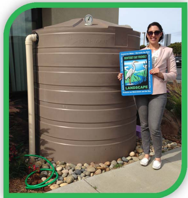
Rainwater cistern installed at MPWMD office. The public is invited to offer locations for cistern installations that the public could attend as an educational opportunity.

Aquifer Storage and Recovery is expected to be doubled in capacity by 2019, to almost 3,000 AFY and is being developed jointly by the District and Cal-Am. However, until permit conditions are modified subsequent to the future lifting of the Cease and Desist Order, not all ASR capacity is reliably available in dry years, hence cannot all be counted upon to offset unlawful diversions. The District continues to develop plans for additional ASR opportunities for future water supply.