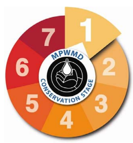
Stage 1–Voluntary conservation rules helped to keep water use below State limits in 2007. A seven stage conservation/rationing program was enacted in 1999.