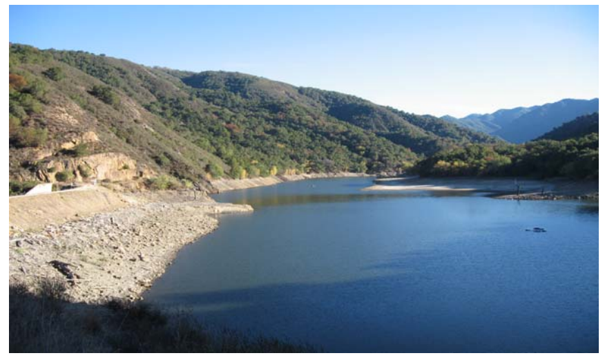
Los Padres Reservoir drawn down to a level of 25 feet below full capacity in Dec 2007.

At the beginning of Water Year 2008 in October 2007, the District was preparing for the possibility of water rationing. The Contingency Implementation Plan for Water Rationing was accepted by the Board on January 24, 2008 and includes estimated costs and staffing of a rationing office. Fortunately, winter rains in late December 2007 helped to reduce the likelihood of drought-related water rationing in 2008.