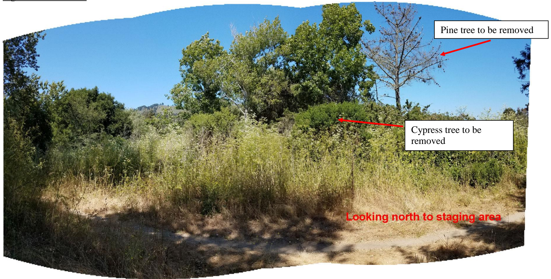
Figure C – view to staging area to be cleared