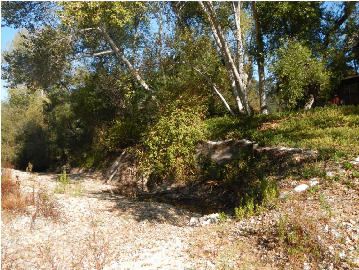
Photo looking downstream at erosion along Big Sur Land Trust/ Lake and Asselborn properties, Carmel River, Monterey County, California, November 7, 2011.

Streambank erosion occurred along approximately 75 feet of the right streambank just downstream of the Rancho San Carlos Road bridge at RM 3.8 in the spring of 2011. The bank continued to erode in the winter of 2012-13. Temporary measures to stabilize the bank including jute net, sand bags, large wood, and willow cuttings do not appear to be adequate to protect the bank from additional erosion. A rock vane (without the J-hook extending into the middle of the channel) consisting of ¼ to two ton rip rap is proposed to be installed. Filtering to prevent piping would be accomplished with an appropriately sized gravel filter. Approximately 30-40 cubic yards of rock (about 60 to 80 tons) would be imported to the site and placed along the streambank to form a vane. Work would be carried out when the river dries up in this reach. Access into the river bottom would be through the Lake/Asselborn property and onto an existing gravel bar shown in the foreground of the photo below. Limited vegetation removal would be required for construction equipment access. Willow cuttings would be placed into the streambank and channel bottom along the rock vane as part of the installation.