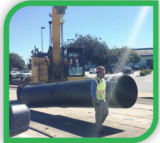
Above - New Monterey Pipeline under construction to facilitate distribution of water from the Pure Water Monterey project, and transmit excess Carmel River water to ASR wells in the winter. Below – Backflush pit at ASR site. 699 AF of Carmel River water were injected for storage in the Seaside Basin in 2016.