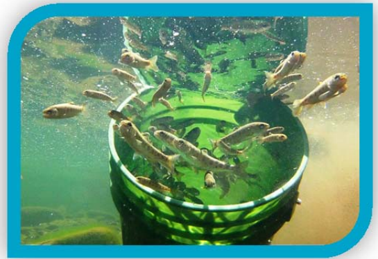
Rescued Carmel River steelhead fish are released into the Sleepy Hollow Steelhead Rearing Facility. In 2016, the District reared 425 rescued steelhead at the facility.

The District successfully rescued 425 wild steelhead from approximately 10.9 miles of the Carmel River, and reared them in the Sleepy Hollow Steelhead Rearing Facility. All fish were electronically tagged and released into the lower river in early December. An additional 239 steelhead were rescued from an isolated pool below Los Padres Dam and released into the river.