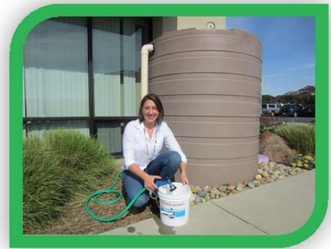
The District offered training on rainwater harvesting methods such as installation of cisterns.