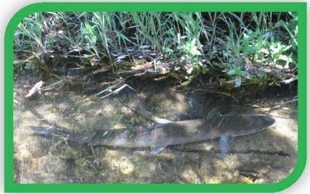
Carmel River steelhead fish. Staff rescued 3,013 steelhead and released them upstream or to the ocean.

Sponsored Commercial, Industrial & Institutional (CII) Water Efficiency Training. The three-day workshop provided a comprehensive overview of key CII water uses. Participants learned about potential water savings, auditing techniques, and return on investment.