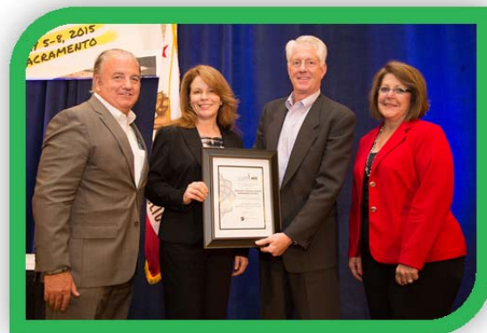
The Association of California Water Agencies presented the Clair Hill Award to the Water Management District for completion of the Pure Water Monterey Demonstration Facility – a joint project with the Monterey Regional

Requirements for Future Capital Improvements: Based on the stated future demands discussed above, the resulting desalination facility size is 6,252 AF with Pure Water Monterey Groundwater Replenishment (GWR), or 9,752 AF without GWR. The Pure Water Monterey project expected to create 3,500 AFY of new supply is being cosponsored by the Monterey Regional Water Pollution Control Agency and the District, which funds 75% of that project from its Water Supply Charge. Product water will be stored in the ground for 6 months and recovered for sale to Cal-Am. Aquifer Storage and Recovery is expected to be doubled in capacity by 2019, to almost 3,000 AFY and is being developed jointly by the District and Cal-Am. However, until permit conditions are modified subsequent to the future lifting of the Cease and Desist Order, not all ASR capacity is reliably available in dry years, hence cannot all be counted upon to offset unlawful diversions. The District continues to develop plans for additional ASR opportunities for future water supply.