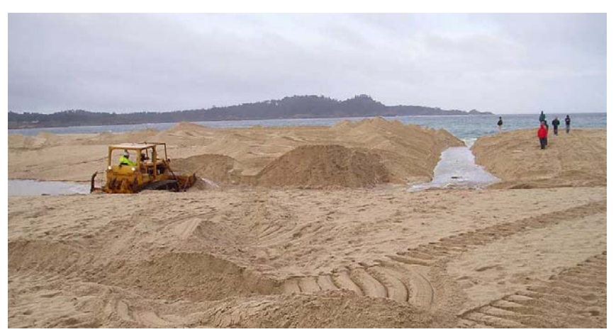
Cutting an outlet through the beach - December 2004

To prevent flooding, Monterey County Department of Public Works cuts a small channel through the barrier beach to allow the water to flow to the ocean before the lagoon rises to flood stage. Continued outflow widens the channel.