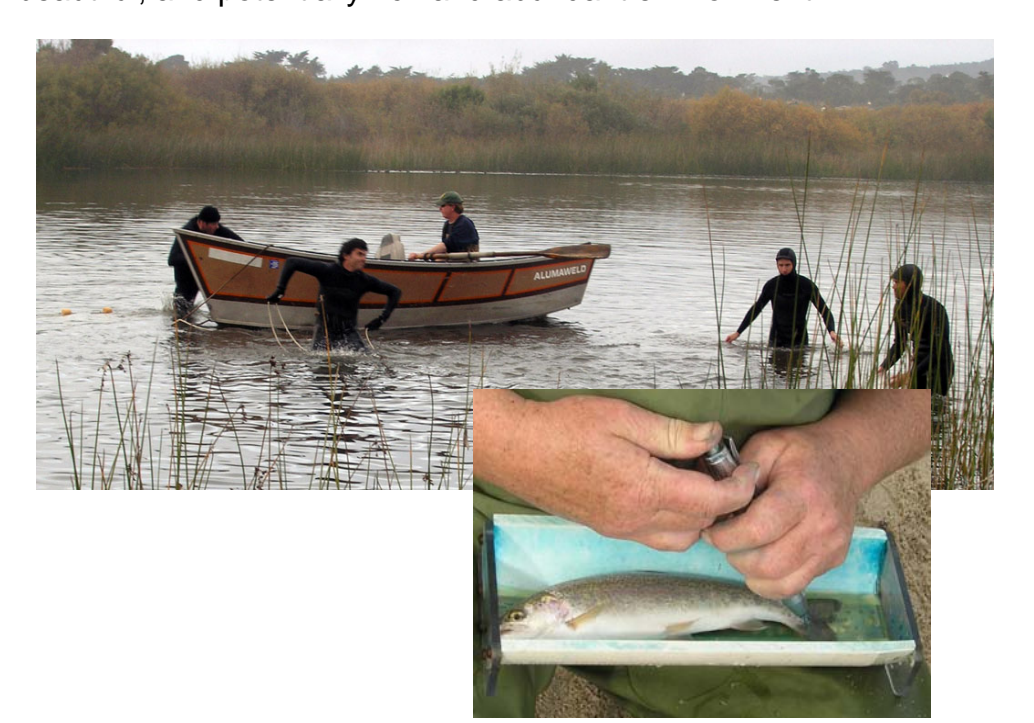
Tagging (shown below) and recapture of steelhead in the lagoon indicate the numbers of fish that could be at risk.

There is no comprehensive long-term, multi-agency plan linking management of the Carmel River and its watershed with management of the Carmel River Lagoon. Effective management of the Carmel River Lagoon will require an understanding of and the ability to effectively work with these complex geofluvial and coastal processes. Therefore, rigorous scientific investigations are necessary to better understand the ecosystem, develop alternative management strategies and assess effects of ongoing and proposed management actions. The understanding and information developed from these investigations are necessary to identify reasonable and prudent management solutions that protect and insure maximum multiple beneficial use of this undeniably beautiful, and potentially rich and abundant environment.