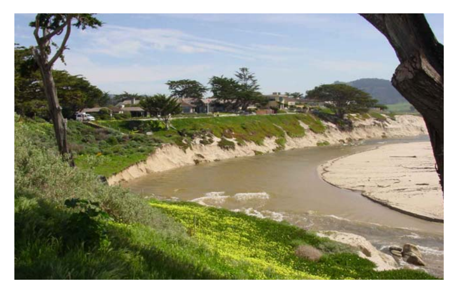
In the past the river mouth has migrated to the north on several occasions. To protect Scenic Road (at the top of the sandy bluff in the center of the photo), the County has redirected the river away from the north end of the beach in five years of the 12-year period between 1993 and 2005 (see next photo).