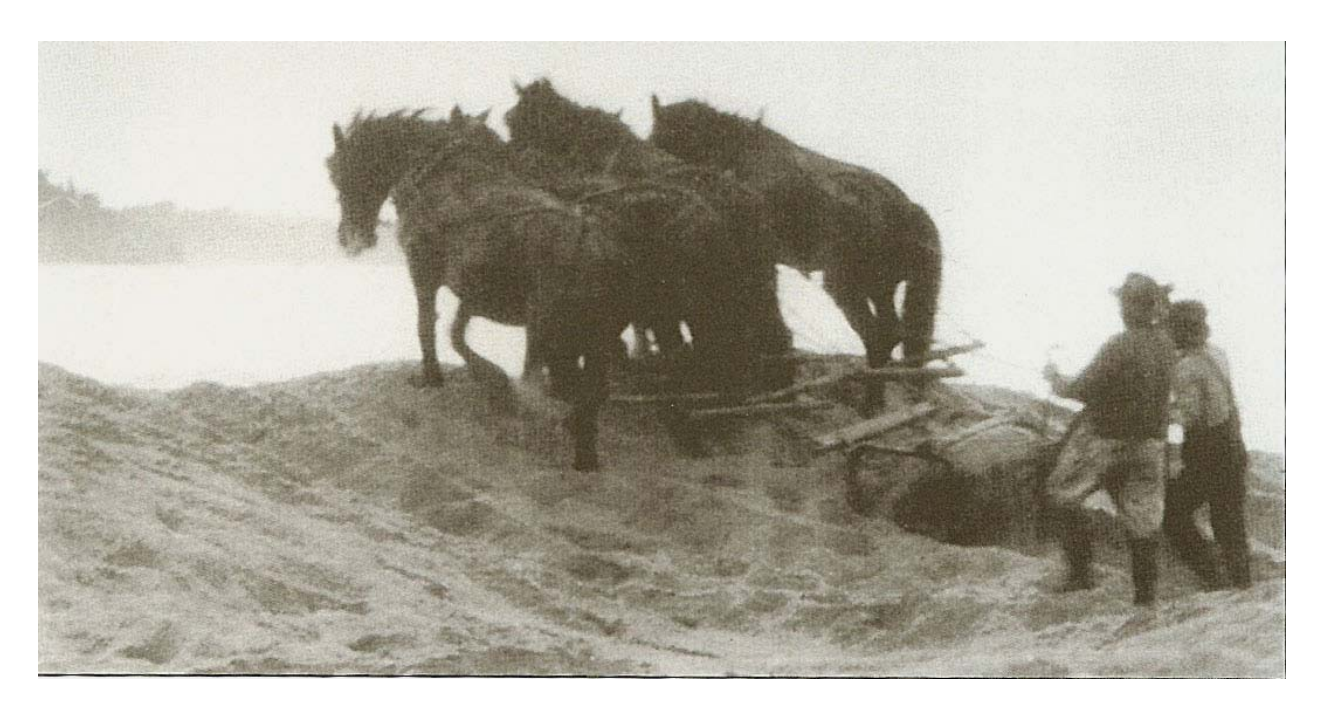
In this c. 1900 photograph, a four-horse team is dragging a scoop, used to create a low spot, so the river mouth would open, decreasing the water level of the lagoon and surrounding farmland. As the land was subdivided and houses began to encroach on the wetlands, it was not unusual to see men take out their shovels and dig a ditch to start the river flowing out, preventing their homes from flooding. (Monterey Public Library Collection.) - Adapted from a new pictorial history book <u>Images of America - Carmel by the Sea</u> by Monica Hudson.

Normally, the nexus for taking action to manage the beach during the winter is the threat of flooding in low-lying area around the lagoon. When the river begins flowing into the lagoon each fall or early winter, the lagoon rises and would, under natural conditions, keep rising until it overtops the barrier beach and creates an outlet channel through the beach. If this process were allowed to occur naturally, the low-lying residential neighborhood to the north of the lagoon would likely be flooded. Historically, the cut for the lagoon outlet has been located on the southern end of the barrier beach, near rocky outcrops. The resultant outflow from the lagoon often cuts a large, nearly straight channel in the barrier beach (a breach) that is low enough to cause the lagoon to drain to a level that significantly reduces or completely eliminates habitat for steelhead and other aquatic species.