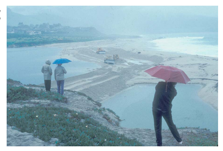
Simultaneous closing of the north outlet and opening of an outlet to the south, March 1993.