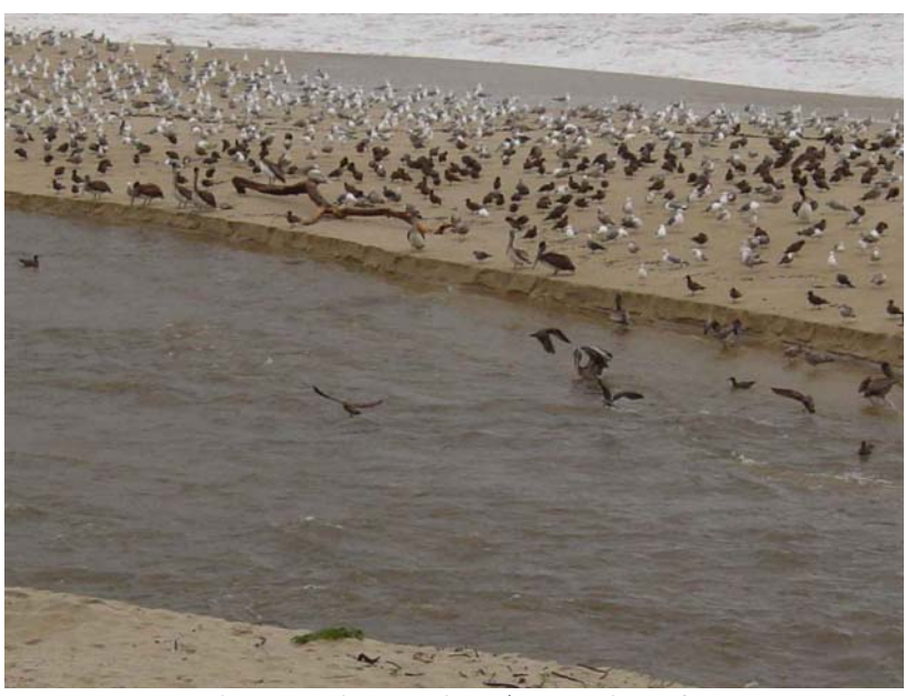
Avian species at river/ocean interface

lagoon of surface inflow, and significantly reduces groundwater inflow. Thus, there is little or no freshwater input during the dry season in most years. Second, low lying homes built before modern floodplain regulations were enacted flood if lagoon elevations fluctuate naturally. To prevent flooding in the neighborhood of the lagoon, the barrier beach is frequently manipulated.