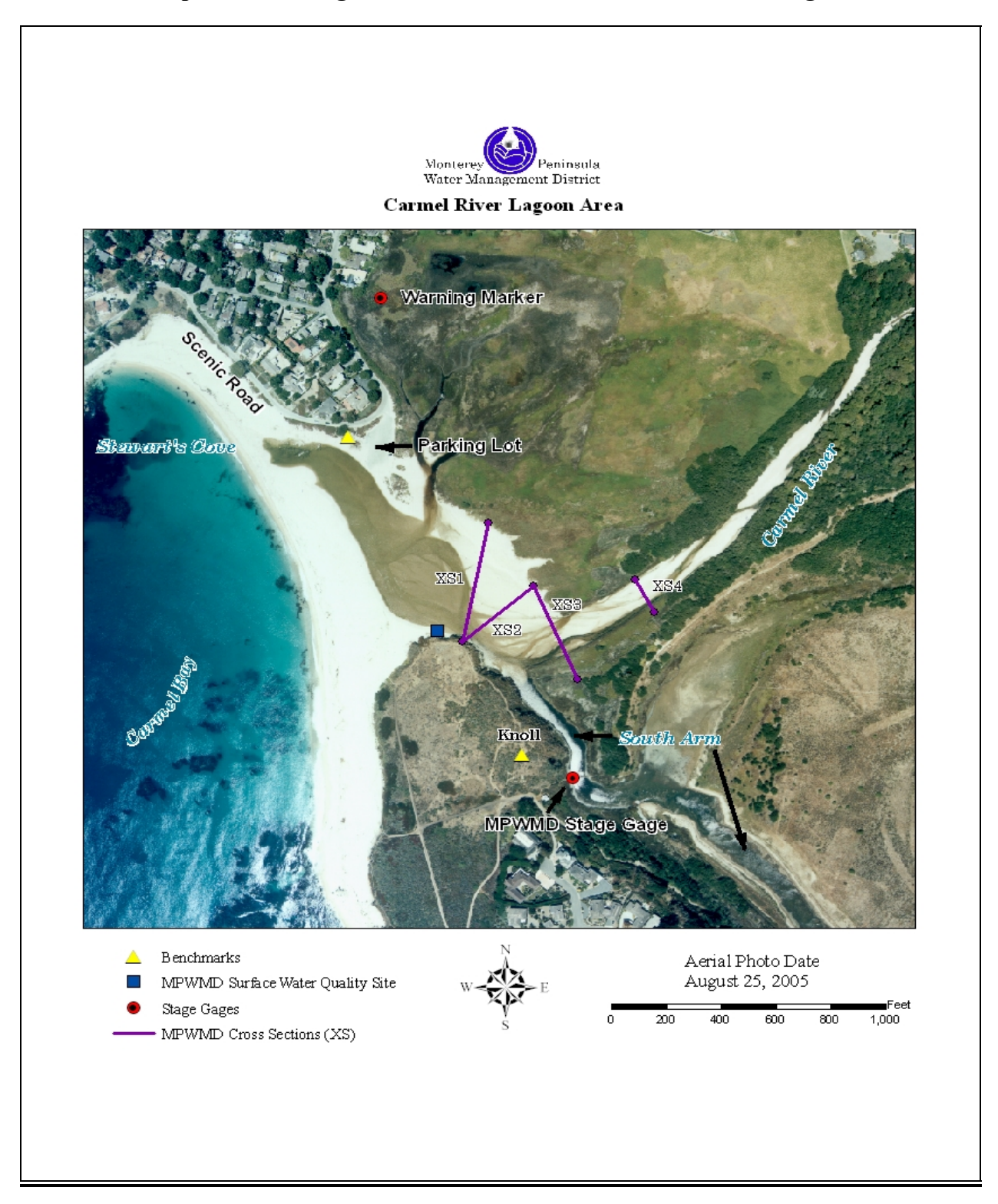
<u>Figure XI-1</u> Map of Monitoring Transects and Stations at Carmel River Lagoon