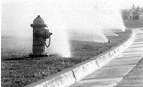
Prevent wasteful irrigation practices.