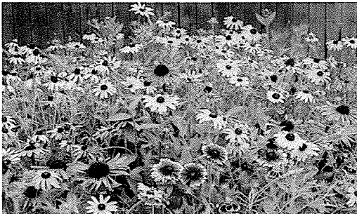
Native perennials conserve water beautifully.