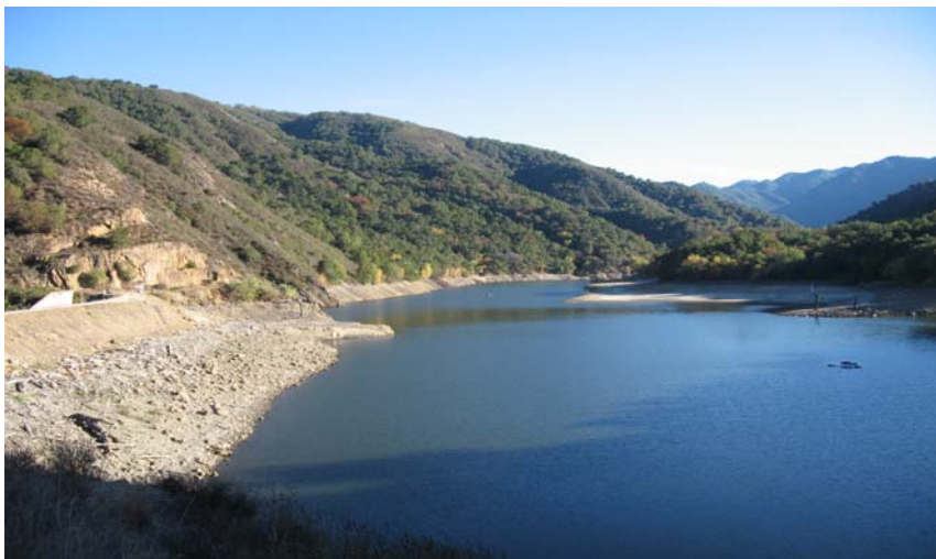
Los Padres Reservoir drawn down to a level of 25 feet below full capacity in Dec 2007.

At the beginning of Water Year 2008 in October 2007, the District was preparing for the possibility of water rationing. The Contingency Implementation Plan for Water Rationing was accepted by the Board on January 24, 2008 and includes estimated costs and staffing of a rationing office. Fortunately, winter rains in late December 2007 helped to reduce the likelihood of drought-related water rationing in 2008.